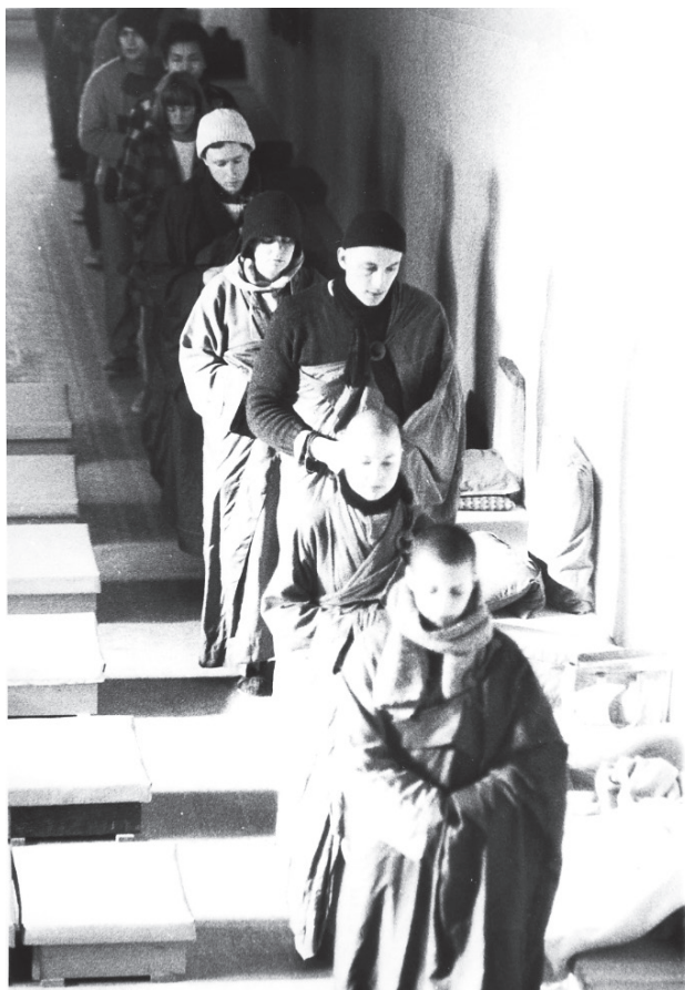
Gold Mountain Monastery in 1974 1974年金山寺